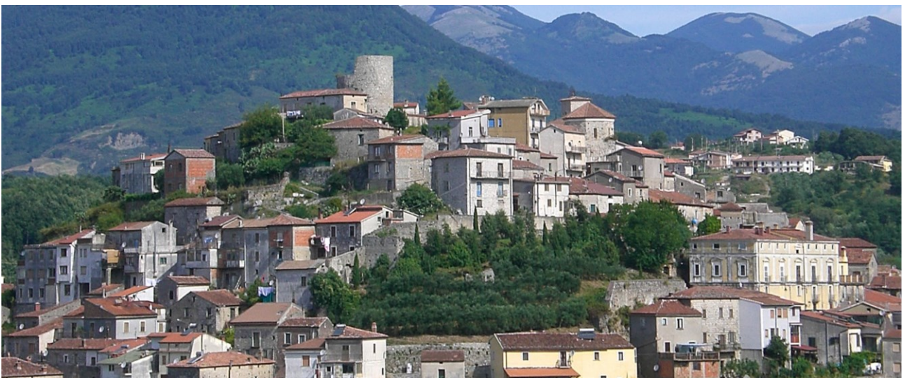
Caselle-in-Pittari

Tetide Aps Association and the Italian Speleological Society are warming up the engines to welcome cavers and researchers from all over Italy and Europe to “Syphonia 2024”, the International Meeting of Speleology that this year will take place from October 31st to November 3rd, and will be held in the charming town of Caselle in Pittari, Salerno, southern Italy. The town has been selected to host the prestigious 4-days event because of its stunning karst landscapes and an intriguing karst phenomenon, the sinkhole of the Bussento river, with its ‘mysterious’ and fascinating path into the depths of the earth.