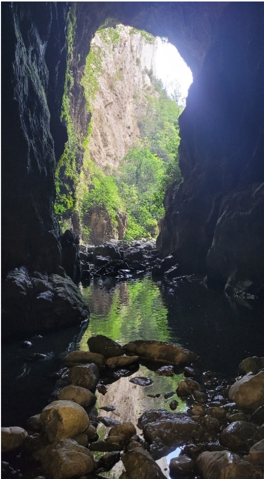
Bussento Sinkhole

“Syphonia2024”, the name itself is a strong giveaway of the protagonists of this edition: siphons , such as the ones formed in the underground bits of the Bussento River, because sumps are also the epitome of the cave exploration, the blessing and the curse of every speleologist, with no exception. As Rick Stanton highlights in his autobiography Aquanaut, a Life Beneath the surface , presented in Italy a few years ago, “The dream of every caver is to follow the water from where it sinks in the ground to where it comes out again, at its resurgence [...] Cave divers are dry cavers who begin diving only as a way to go further in the cave; when they reach a sump, they need to dive through it to reach more dry cave”.